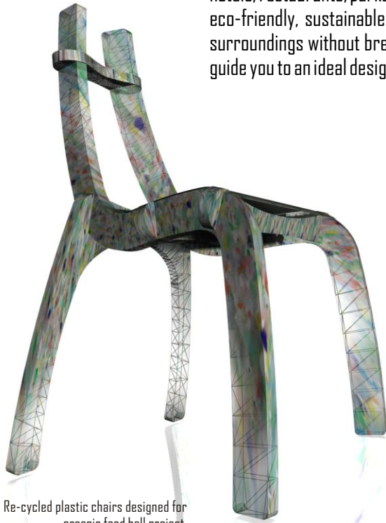
Re-cycled plastic chairs designed for organic food hall project.