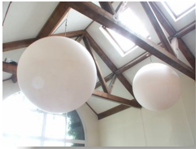
LUMINAIR LUNE OFF / DAY.