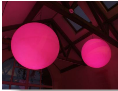
LUMINAIR LUNE ON / NIGHT.